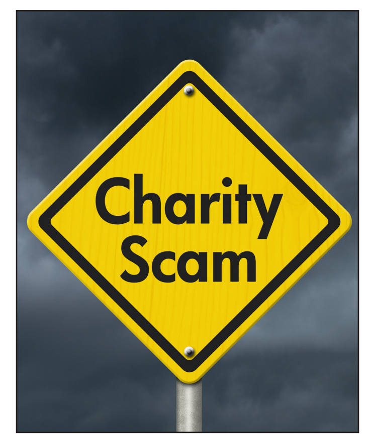
How Is Your Money Used?

Some charities use paid fundraisers to contact you for a donation. These fundraisers may keep a portion of your gift as their fee. Find out how much