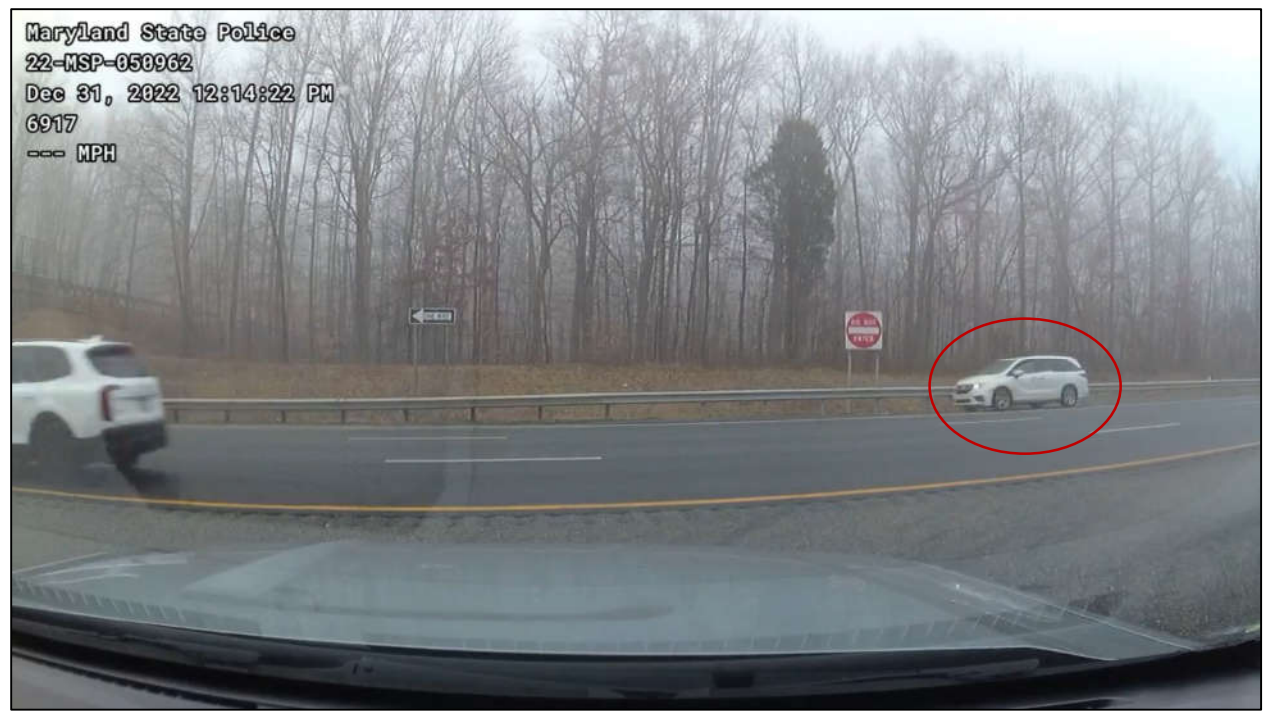
Image 1. Still frame from Trooper Manuel's dashboard camera footage as he is stopped in the crossover area prior to Winch Road, facing I-95 North. The white Honda Odyssey minivan (in red circle) is driving on the right shoulder.

As noted above, Trooper Manuel was stationed in the crossover area on I-95 near mile marker 95. He was in an unmarked MSP patrol car that was equipped with a dashboard camera that recorded the car's external view, speed, and audio from inside the car. According to this dashboard camera footage, at 12:14:22 p.m., the minivan drove past the crossover on the right shoulder. Trooper Manuel immediately pulled onto the roadway and began driving northbound on the left shoulder.