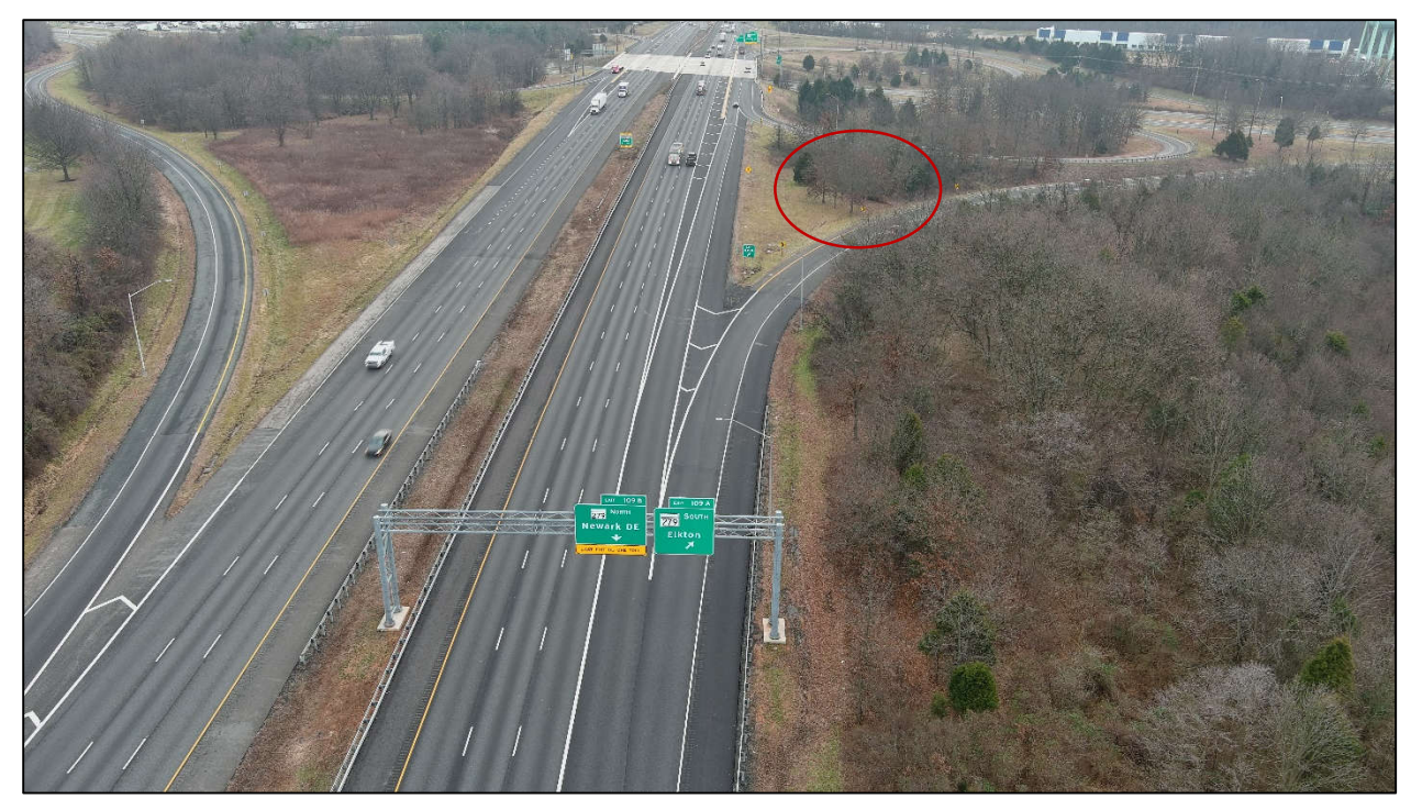
Image 3. Aerial photograph showing the approximate site of the collision (in red circle), exit 109A (Maryland Route 279 South) off I-95 North.