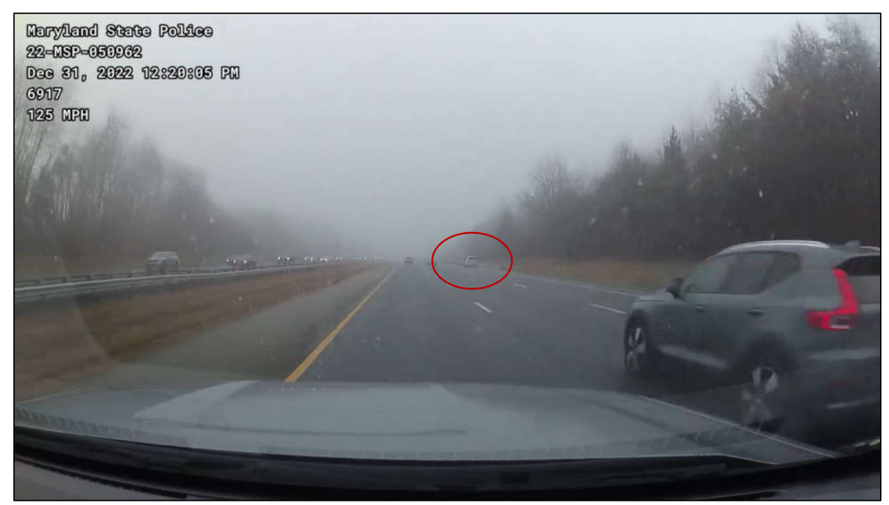
Image 2. Still frame from Trooper Manuel's dashboard camera footage as he was driving 125 miles per hour in lane one. The minivan (in red circle) is in lane three.

For the next couple of minutes, the pursuit continued in a similar fashion with Trooper Manuel driving in excess of 100 miles per hour on the left shoulder and in lane one. At around 12:22:40 p.m., Trooper Manuel pulled closer to the minivan, and the two vehicles approached a sign indicating exit 109A-B (Maryland Route 279) was 0.5 miles away and was the last exit before a toll at the Delaware line. The minivan quickly cut over from the left shoulder all the way to the right shoulder and accelerated. Trooper Manuel followed onto the right shoulder.