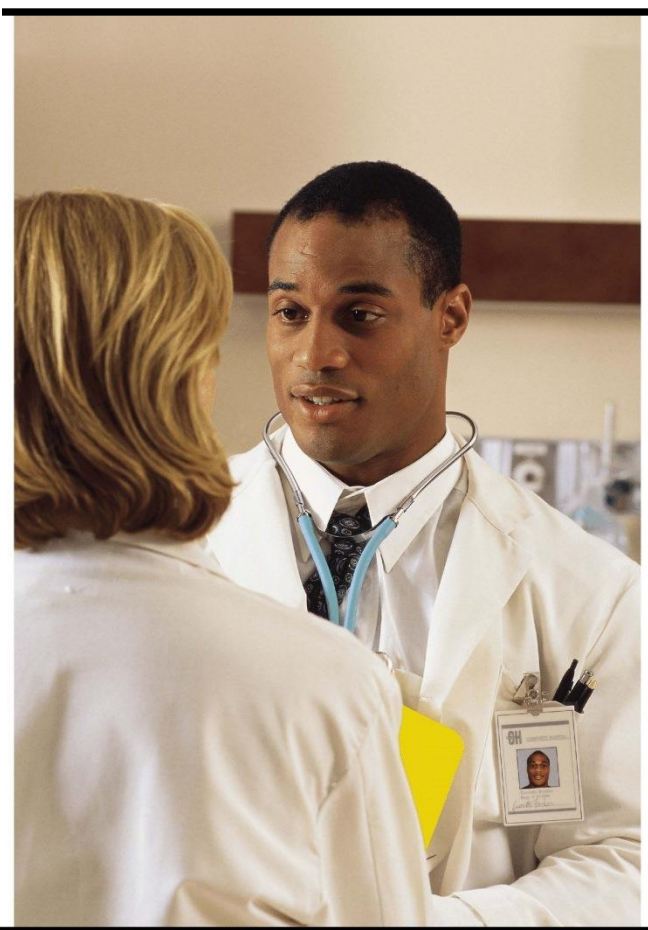
A Guide to Maryland Law on Health Care Decisions (Forms Included)

STATE OF MARYLAND OFFICE OF THE ATTORNEY GENERAL