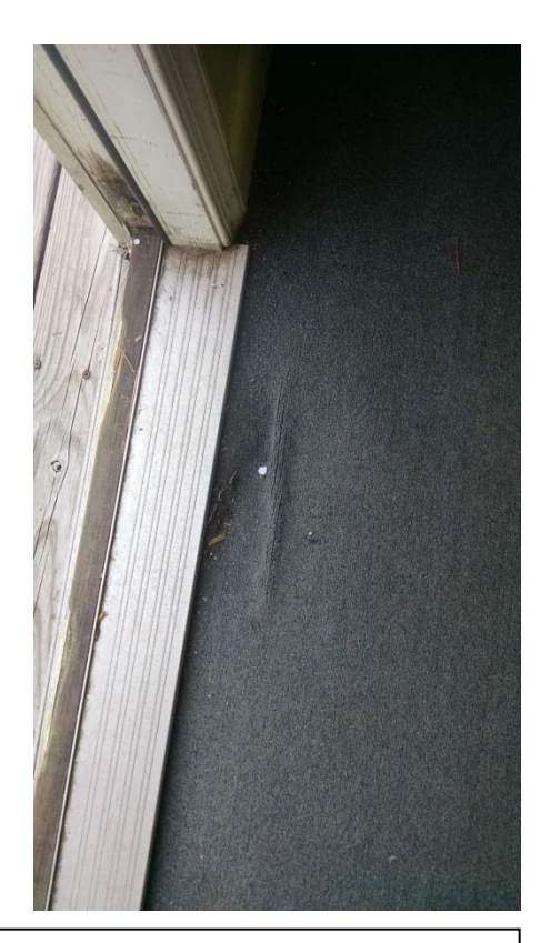
The interior and exterior of the education trailers at Noyes