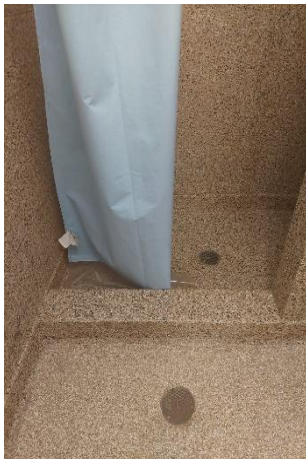
Step at entrance of shower

Detention centers are not designed to meet the needs of children with significant physical disabilities. During the fourth quarter, a paraplegic young person with bowel and bladder dysfunction was detained at Hickey. The young person could not shower with privacy and dignity because the facility shower was not configured to accommodate his needs. The youth could not enter the shower with his wheelchair because of a step at the entrance of the shower. In addition, the handheld shower head was mounted high on the shower walls which the youth could not reach. As a result, the youth had to shower in an area outside the shower stall and place the shower head on the floor after he was done showering.