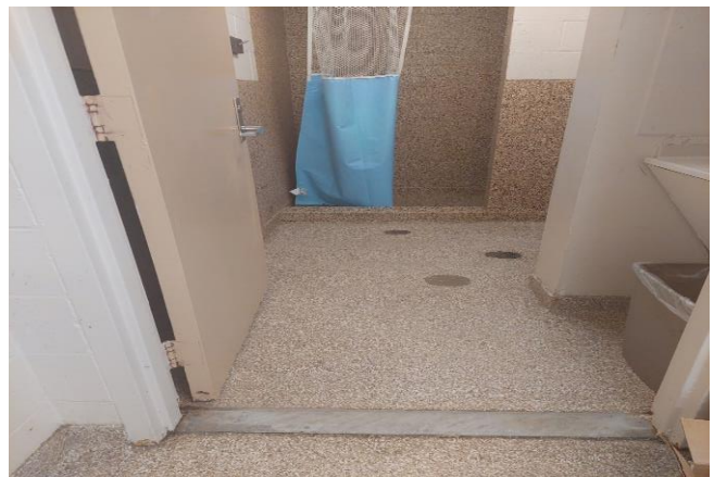
Area outside shower stall

The youth was also concerned that he could not maneuver his wheelchair up hills on facility grounds and so required assistance from other youth or staff.