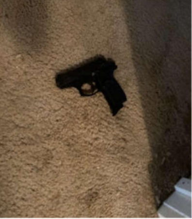
Image 5. Firearm located in hallway. Officers initially moved the weapon to render it safe before placing it back in its original location.

Officer Speight called for EMS, who arrived and took over attempts at resuscitating Mr. Coupal at 4:31 p.m., approximately 6 minutes after the shooting.<sup>4</sup> He was ultimately